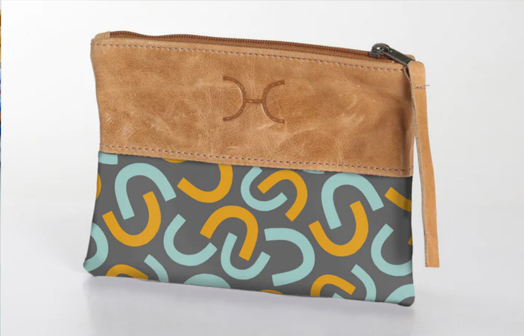
POUCH LAMINATED FABRIC WITH LEATHER