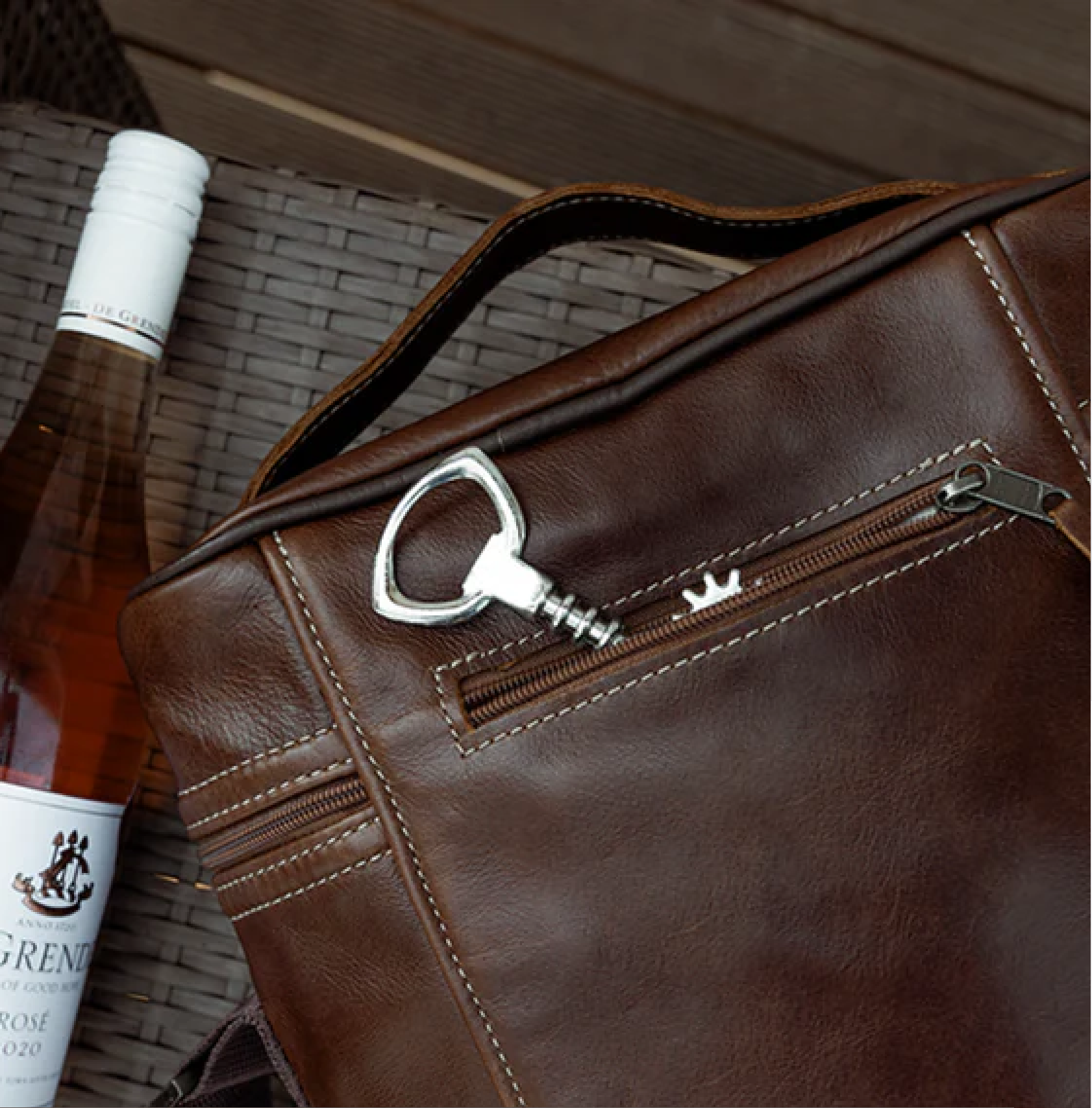
WINE COOLER JUMBO CARRY BAG LEATHER