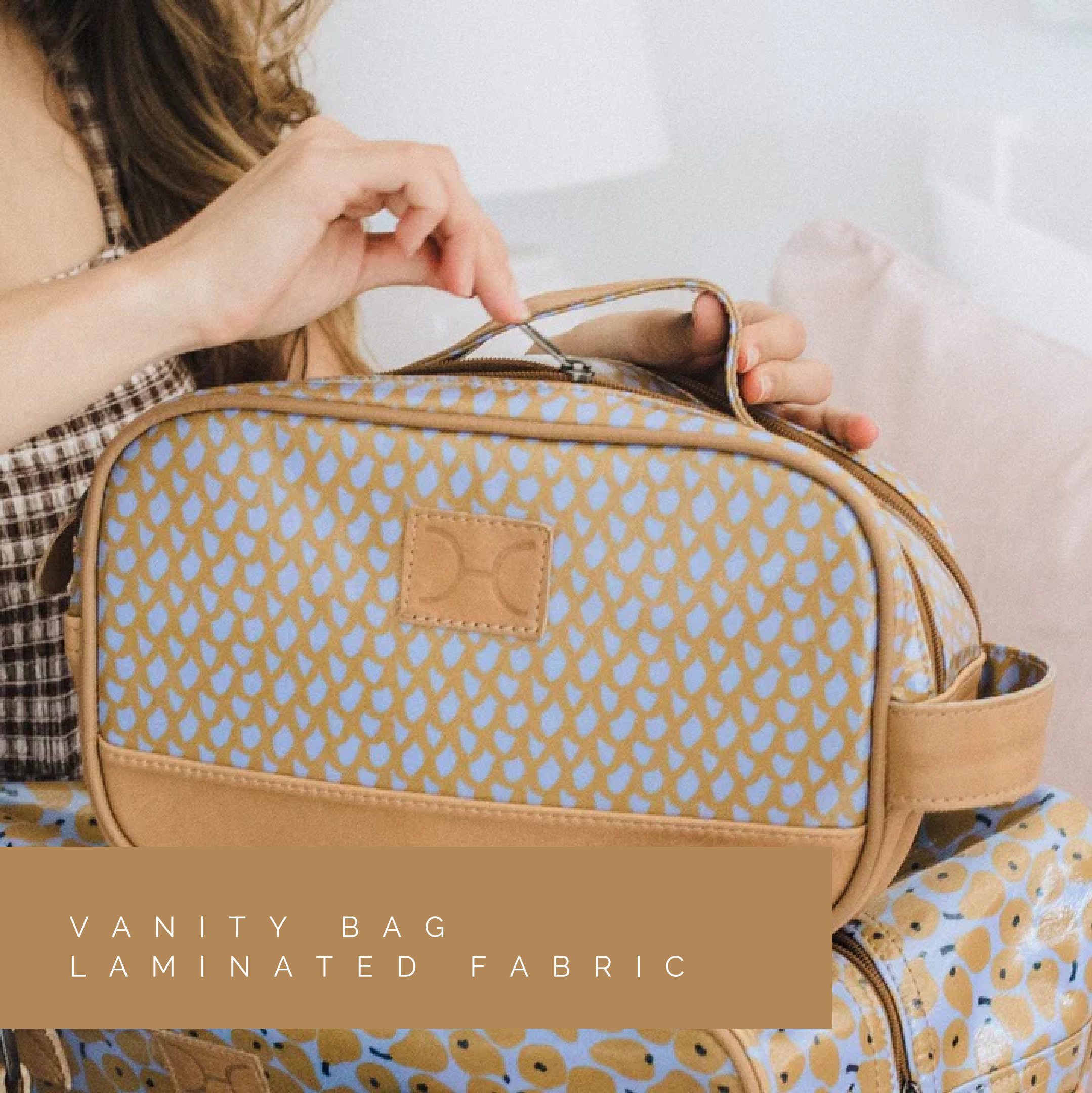
VANITY BAG LAMINATED FABRIC