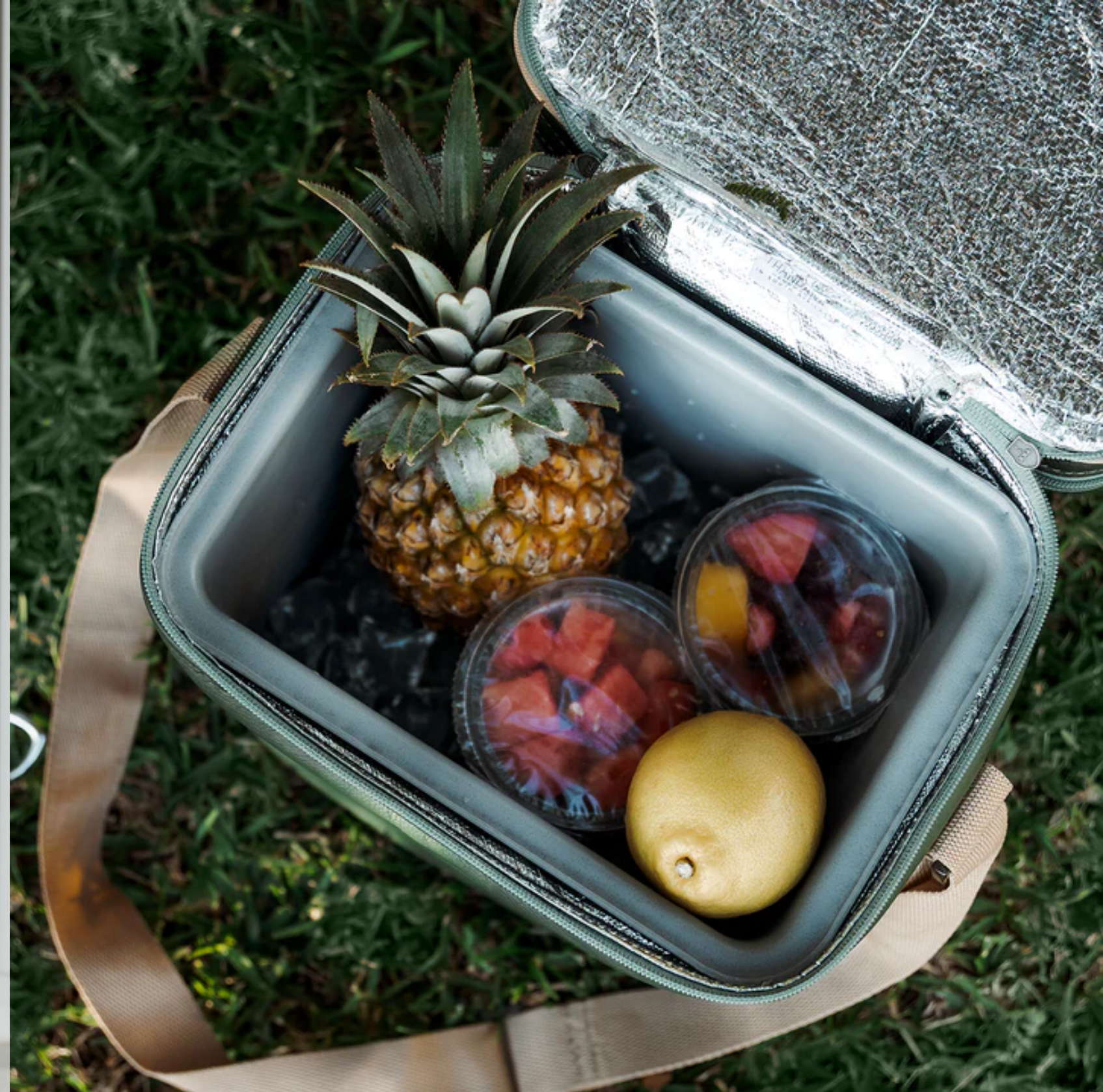
B I G L U N C H B O X C O O L E R L E A T H E R