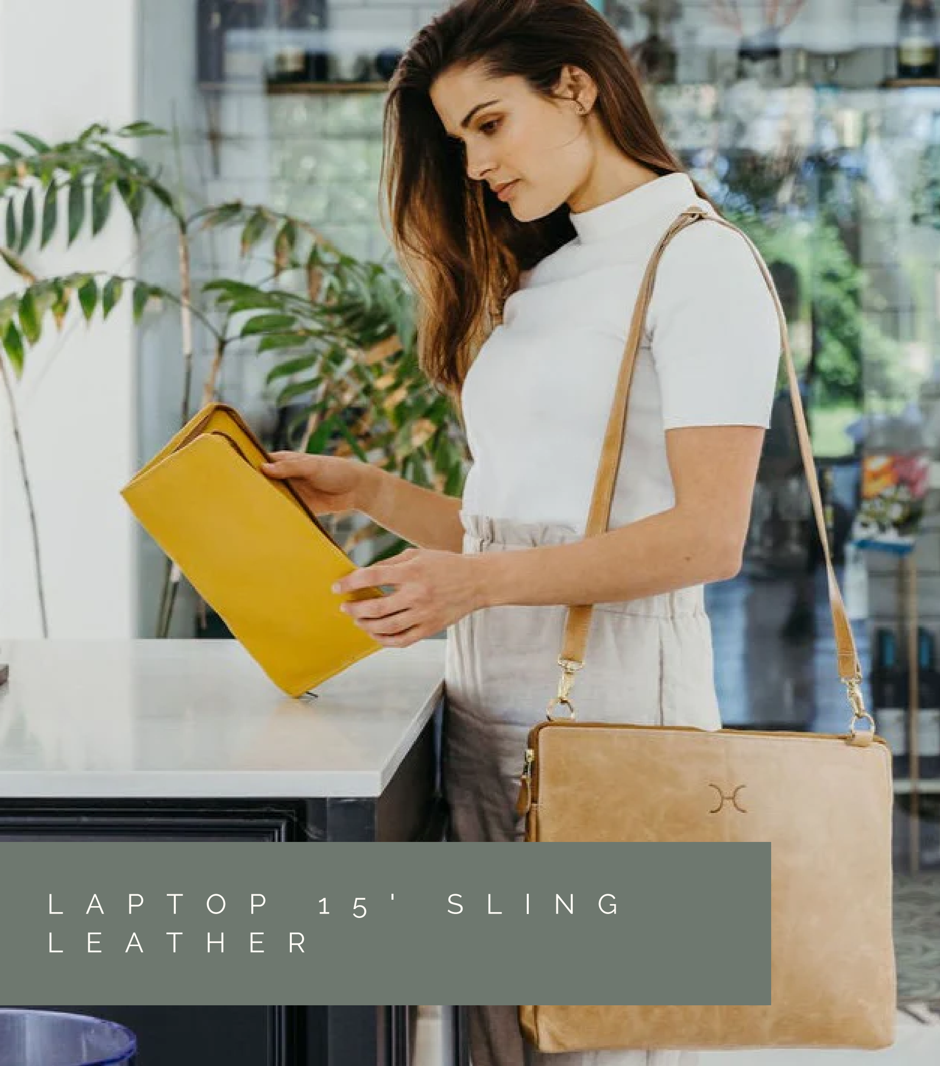
L A P T O P 1 5 ' S L I N G L E A T H E R