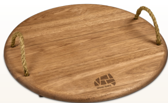
HL-OK-128-B OKIYO HOMEGROWN WOODEN MEDIUM ROUND FOOD PLATTER