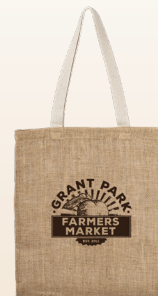
BG-OK-373-B OKIYO YASASHII JUTE SHOPPER