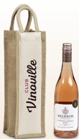
HL-OK-122-B OKIYO INSHU COTTON WINE TOTE