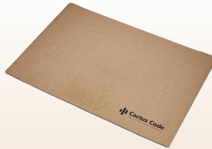
GF-OK-918-B OKIYO SEIRI CORK DESK MAT