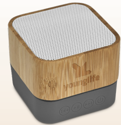
MT-OK-371-B OKIYO OTO BAMBOO BLUETOOTH SPEAKER