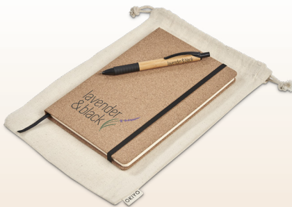
GF-OK-898-B OKIYO NOTO A5 HARD COVER NOTEBOOK GIFT SET