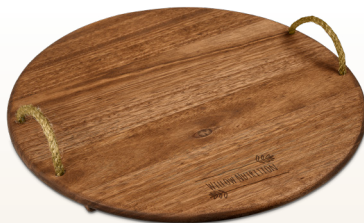
HL-OK-130-B OKIYO HOMEGROWN WOODEN LARGE ROUND FOOD PLATTER