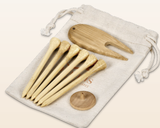
GF-OK-934-B OKIYO NIKKO BAMBOO GOLF ACCESSORIES SET