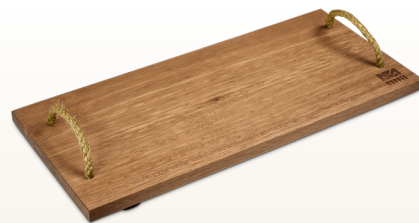
HL-OK-131-B OKIYO HOMEGROWN WOODEN RECTANGULAR FOOD PLATTER