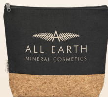
BG-OK-375-B OKIYO KORUKU CORK ACCESSORY BAG