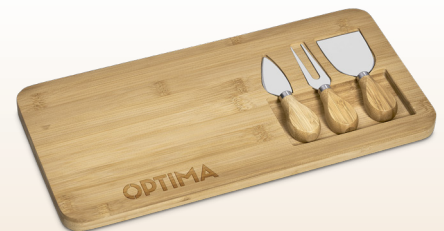
HL-OK-124-B OKIYO CHIZU BAMBOO CHEESE BOARD SET