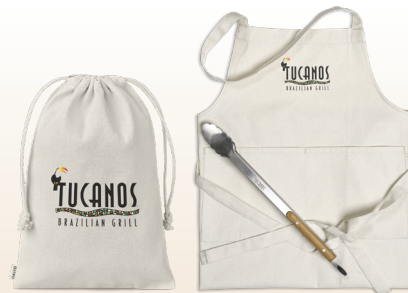
GF-OK-830-B OKIYO WASHOKU GIFT SET