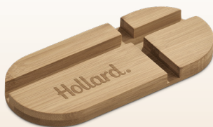
MT-OK-393-B OKIYO KUROSU BAMBOO PHONE STAND